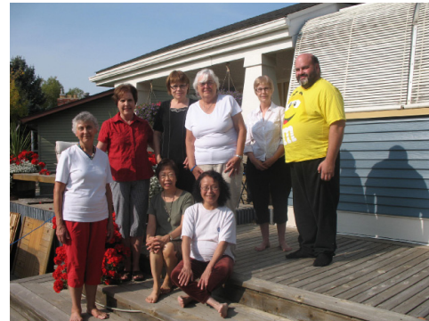
Sherwood Park Practice Group Autumn 2012